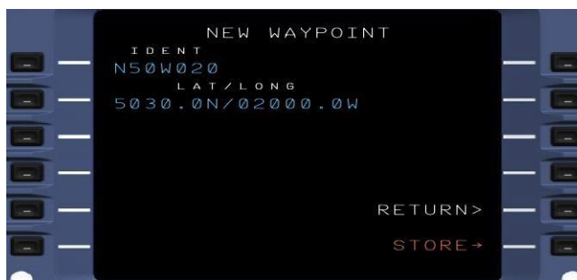
Figure 1. Example FMC Display: Full Waypoint Latitude and Longitude (13-characters) inserted into FMC

Note: Figure 1, Figure 2 and Figure 3 are intended to support paragraph 5b. Pilot Training on Map and FMC Displays of ½ Degree and Whole Degree Waypoints:).